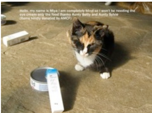
Skiathos Cats, Greece